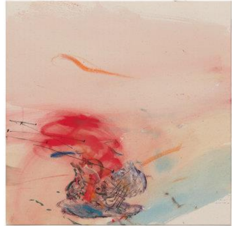
Leiko Ikemura , dude , 2022. Tempera and oil on jute. 80 x 80 x 4.5 cm / 31 1/2 x 31 1/2 x 1 3/4 in, Verso upper middle signed: Ikemura; verso upper right inscribed: M-22-04 .

The painting dude , 2022 intrigues the viewer not only through its sensual forms and delicate and vibrant tones, but also through its title which refers to the colloquial term for a person, typically male. The work offers various possibilities for association, inviting a possible link between the fleshy palette and a form, perhaps human, that appears to emerge from the artist's brush. " Imagination is the strongest force in my work ", says the artist. It is precisely through Ikemura's unique imagination that the viewer is invited to journey through her poetical depictions, both familiar and otherworldly.