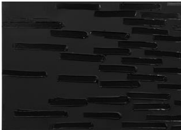
Pierre Soulages, Peinture, 128 x 181 cm, 10 avril 2015 , 2015, Acrylic on canvas. 128 x 181 cm / 50 1/2 x 71 1/4 in. Verso upper right signed, titled and dated: SOULAGES " Peinture 128 x 181 cm 10 Avril 2015 " PSou/M 80

Peinture, 128 x 181 cm, 10 avril 2015 belongs to the famous Outrenoir paintings on which Pierre Soulages (1919, Rodez – 2022, Sète) had been working since 1979. The term refers to a reflected light that is beyond black. Evolving over a period of more than forty years, this body of work has undergone numerous variations. Soulages often said that his “all black” paintings offered him limitless possibilities. The Outrenoir works reflect and absorb light; they are the result of the meeting of ambient light and the black field of acrylic that covers the entire canvas and is incised with homemade tools to create different surface effects. In Peinture, 128 x 181 cm, 10 avril 2015 , short horizontal grooves of thick paint are removed, inviting light to pour in and out of the indentations and to skim across the untouched zones of the surface.