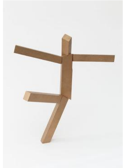
Joel Shapiro , Untitled , 2015-2018, Bronze, unique piece. 52.7 x 51.4 x 18.4 cm / 20 3/4 x 20 1/4 x 7 1/4 in. Stamped: J. Shapiro 2485 2015-18 JS 2485 JS/S 97

Untitled , 2015-2018 reflects the artist’s tireless investigation into form and movement. Here, the geometric figure is composed of six rectangular shapes, engaging with the surrounding space through dynamic motion. In keeping with other sculptures by Shapiro, the present work shows a playful approach to composition, where the human stick-like figure appears in mid-jump. Kicking a leg and arms outstretched, the viewer instantly recognises a universal emotional state of mind, that of joy. Contrary to Minimalism, Shapiro insists on being referential. By reintroducing the human figure into sculpture, Shapiro refers to his works as a “physical manifestation of thought in material and form.”