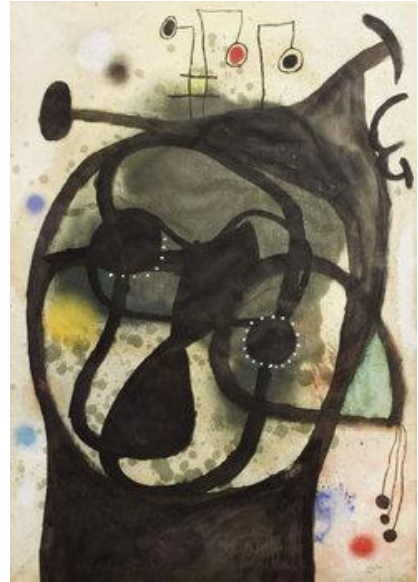
Joan Miró , Tête de Femme , 1966, Ink and water colour on paper.

Tête de Femme , 1966 is a semi-abstract ink on paper that depicts the head of a woman whose facial features appear as swirling calligraphic lines of black ink. Instantly recognisable as Miró's mark making, the background is composed of pictorial signs and gestures, notably dots of primary colours, joined by a network of thinly painted lines. The figure's tilted head and expressive gaze reveal a playful and intuitive approach to portraiture. Tête de Femme is an image of pure invention, but its recognisable form remains close to the limits of objectivity.