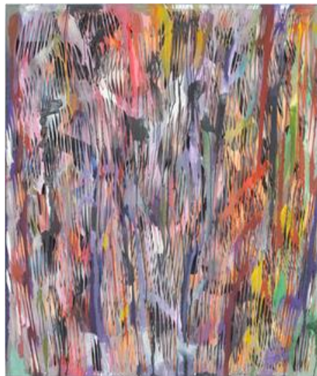
Georgia Russell, Untitled , 2022

Light is an essential component in both Russell's abstract and figurative works. Untitled , 2022 is comprised of two superimposed canvases. The stroke of the artist's paintbrush, its direction and the rhythm of the pictorial gesture are disrupted by the direction of the scalpel incision, as well as by the contrast between empty shapes and the parts of the canvas left untouched. Changing the blades every five minutes in order to maintain crisp lines and working simultaneously from one canvas to the other, Russell masterfully opens up cells of light. Once united, the incisions on both layers of the canvas create an optical confusion, transforming the work into a dynamic three-dimensional play of light, shadow and colour.