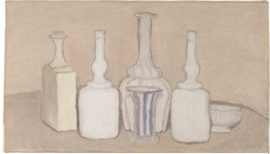
Giorgio Morandi, Natura Morta , 1947, Oil on canvas. 27.5 x 47.2 cm / 10 3/4 x 18 2/3 in. Frame: 36 x 55.5 x 5 cm / 14 1/4 x 21 3/4 x 2 in. Recto lower right signed: Morandi GM/M 23

Natura Morta , 1947 is an exceptional painting that gives an insight into Giorgio Morandi's (1890, Bologna – 1964, Bologna) aesthetic preoccupations in the aftermath of World War II. The artist's desire "to touch the core" or "the essence of things" resulted in a highly meticulous staging of objects in his still life works. Comparing the genre to architecture, still life became a laboratory for Morandi's experimentations and conceptual investigations into the process of representation. Morandi's art focused on depicting his immediate environment such as household objects, (bottles, vases, vessels and cartons), present in his studio including views of the surrounding landscape from his window. Brushstroke, colour, space, line and light became important subject matter in their own right.