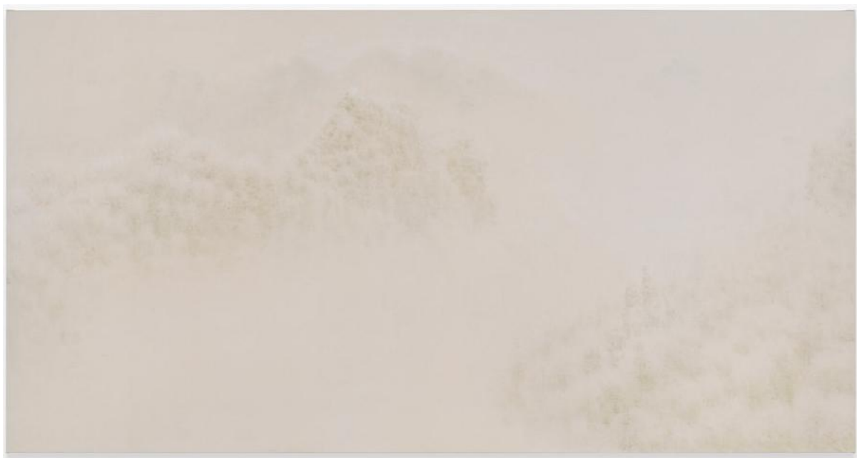
Untitled , 2016, oil on canvas, 153 x 293 x 3 cm | 60 1/4 x 115 1/3 x 1 1/4 in