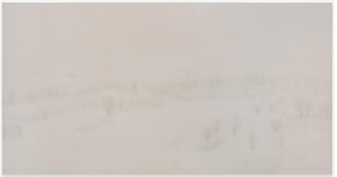
Untitled. , 2016, oil on canvas, 153 x 294 x 3 cm